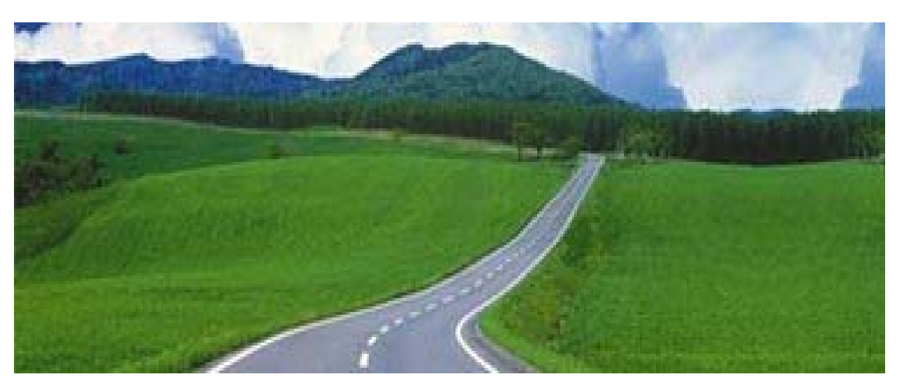
Copyright © 2011. ALL RIGHTS RESERVED International Freezone Association Inc.